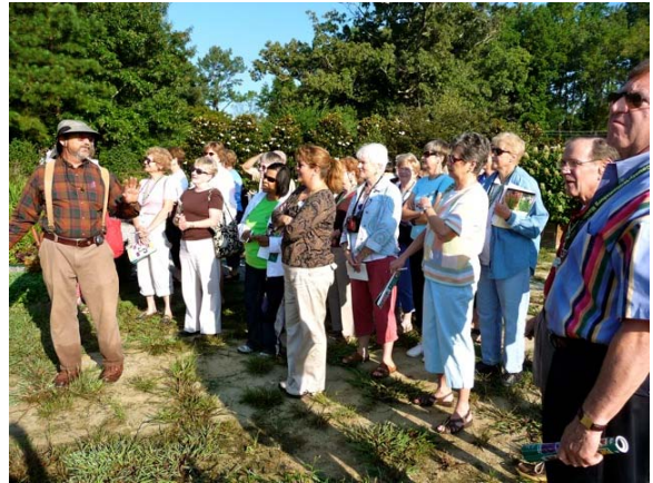
MG Field trip to Brent & Becky's, Sept. 14, 2009