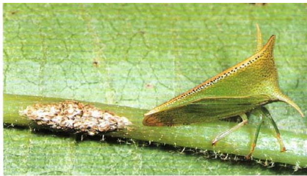
This treehopper from Costa Rica guards eggs she has buried in the midrib of a leaf. She herself is protected from predators by the sharp horns protruding from her prothorax.

Many plants look stunning in the winter – sedums, orange coneflowers, switchgrass and Indiangrass provide contrast against evergreens in the winter.