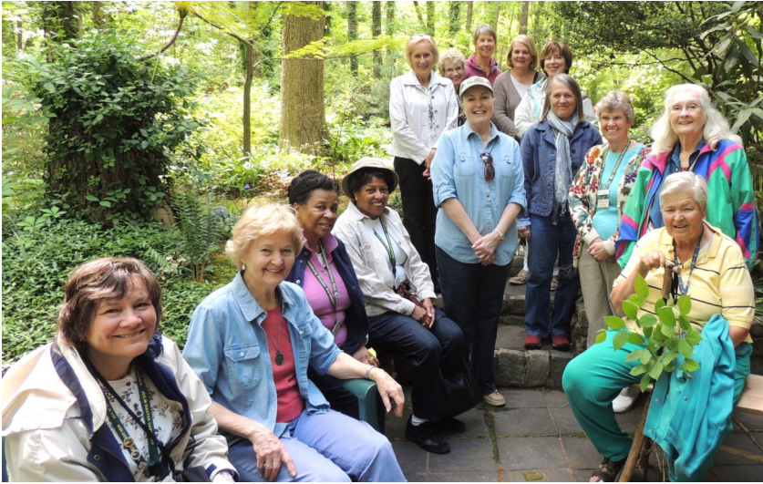
Norie Burket tour participants.