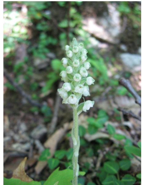
Photos: Rattlesnake Plantain leaves (above) and blooms (left) taken by Jan Newton