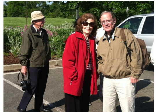
Ginter Field Trip participants.

Enjoy our photos. They show only a small part of the wonderful visits we had.