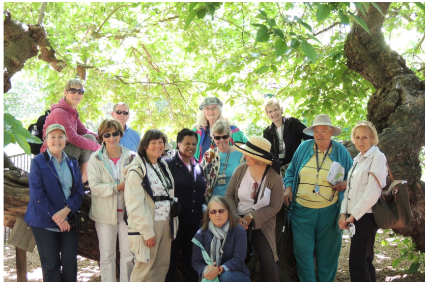
Norie Burket tour participants by a Red Mulberry Tree.