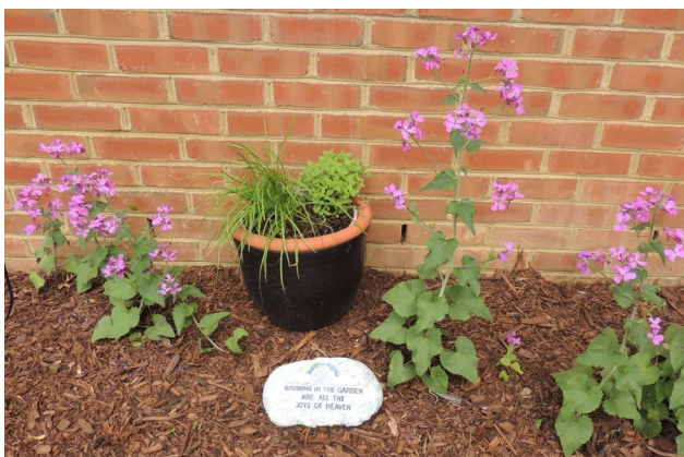
Money plants along the wall of the Respite Care Center

A few years ago I planted Lunaria , otherwise known as money plant, honesty, or silver dollars. If self seeds, so I shouldn't have been surprised when I had a nice patch this year. At the Methodist Church Respite Care Center we met with clients outside last month, and the first request was from a staff member asking me to identify a plant. The area had recently been cleaned up and mulched, with the workers having taken everything out but some flowering plants. These turned out to be money plants surrounding a pot of garlic chives and oregano, the remains of