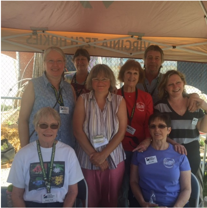
JCCW Master Gardeners working the New Kent County Envirothon on April 18.