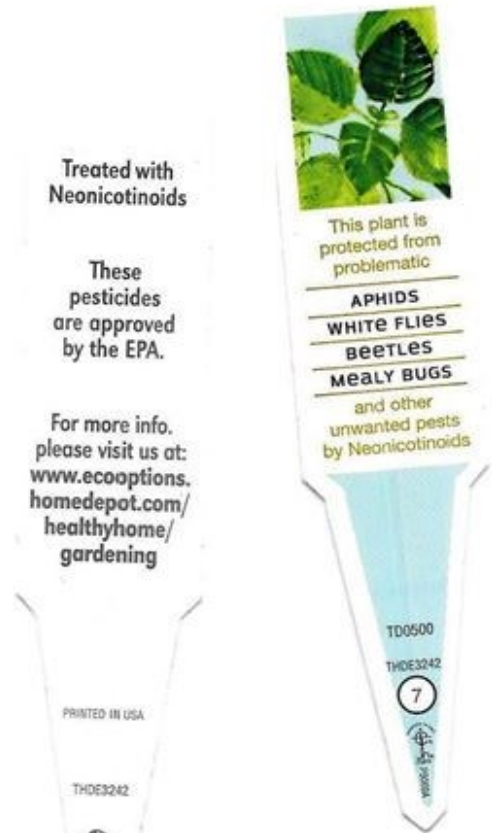
Tags from a perennial plant in a display outside Home Depot

So, please, look for this label before buying any plant, and do what you can to help ban neonicotinoids altogether.