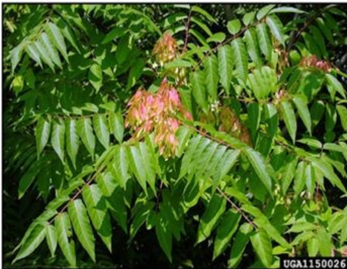
Tree of Heaven