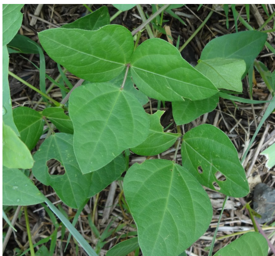
Photo: Annual Sand Bean ( Strophostyles helvola ) taken by Helen Hamilton

The two species can be distinguished by the shape of the leaflets; those of Annual Sand Bean ( S. helvola ) are wider and usually somewhat lobed, with the terminal lobe wider than the others. Annual Sand Bean is a pioneer plant, often found colonizing open sites in either moist or dry conditions, even on cinders. It grows on dunes, beaches, lowland forests, sandy woodlands and clearings. The range is from Quebec to Minnesota and South Dakota and south to Florida and Texas.