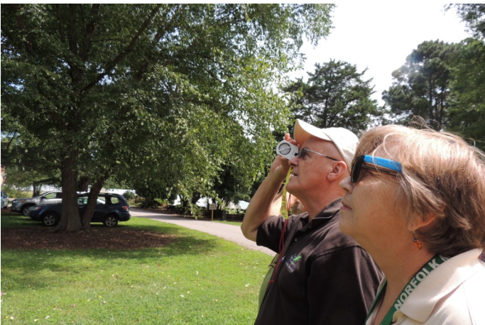
Using the clinometer at AREC workshop