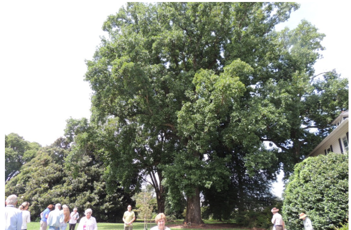
Tulip tree at AREC Workshop