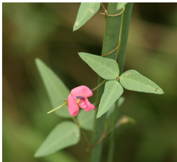
Photo: Perennial Sand Bean ( Strophostyles umbellata)

The leaves of Perennial Sand Bean are narrow, lance-shaped, and longer. The range is from southern New York to Florida and Texas north in the interior to Indiana and Oklahoma. Preferring somewhat drier conditions, this plant occurs in dry or rocky woodlands, old fields, and dry meadows but also in freshwater tidal marshes.