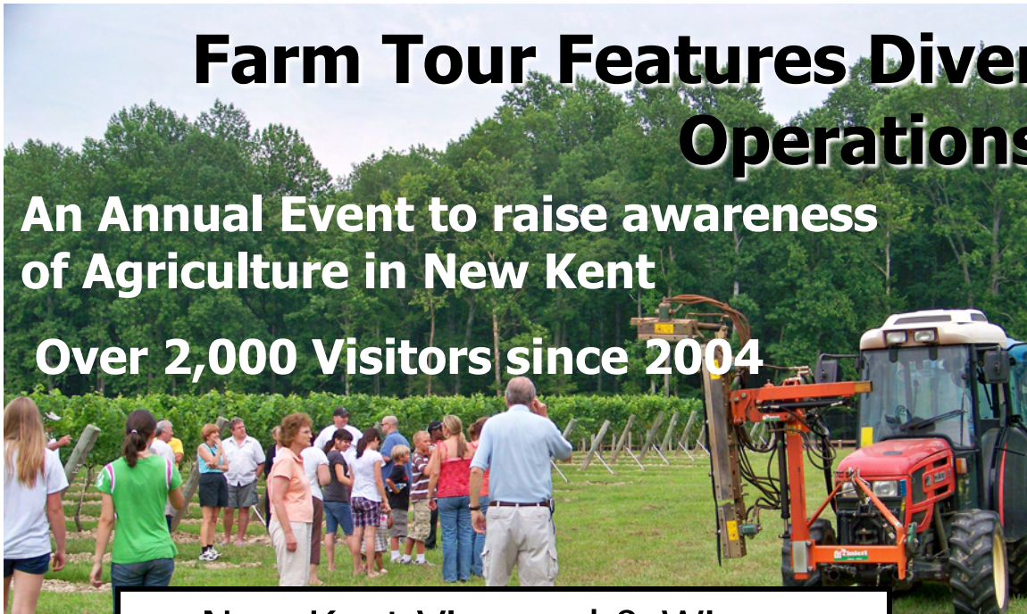
New Kent Vineyard & Winery