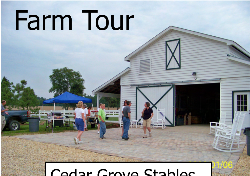
Cedar Grove Stables