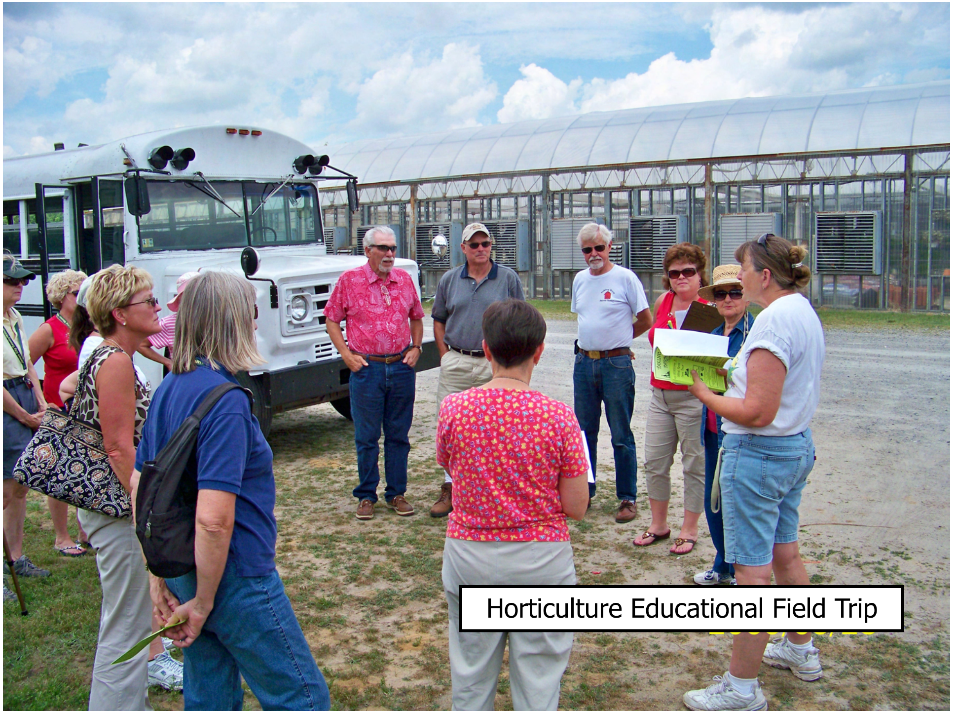
Horticulture Educational Field Trip