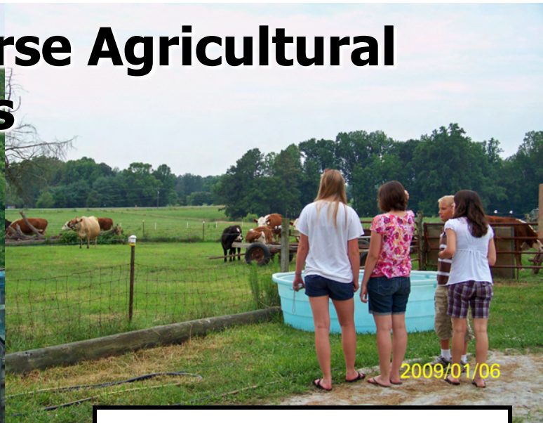
Poplar Springs Farm