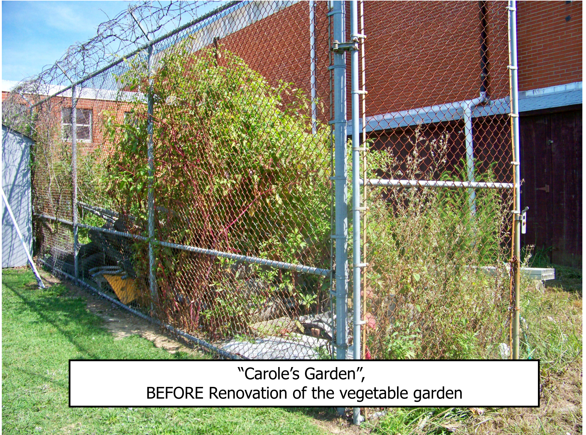
"Carole's Garden", BEFORE Renovation of the vegetable garden