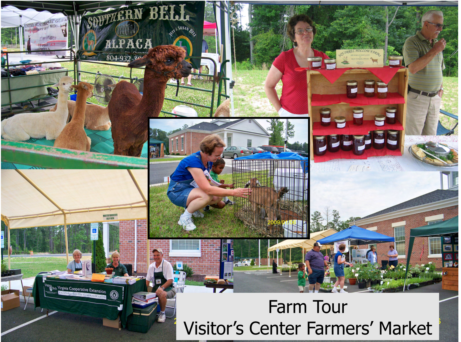
Farm Tour Visitor's Center Farmers' Market