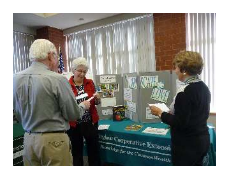
Landscape Love Booth at Turf Love U