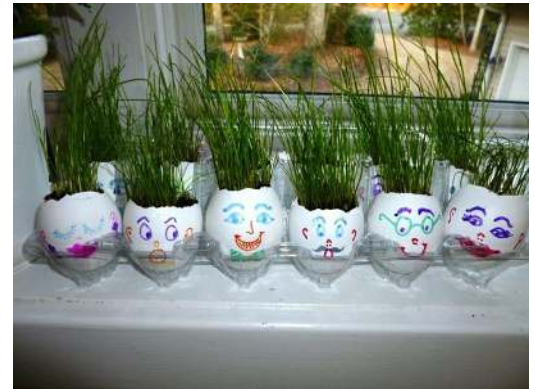
Eggheads: Stars of the Show