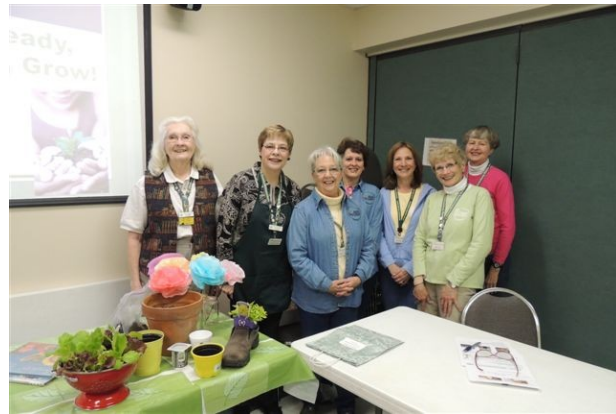
Ready, Set, Grow Team