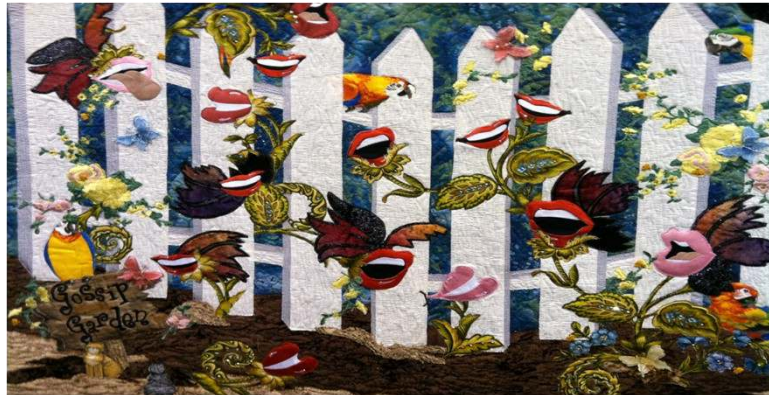
The Gossip Garden

I attended a quilt fair a few years ago and saw the quilt shown below. I asked if I could take a picture as not all quilters want their work photographed.