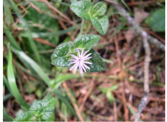
Photo: Hairy Elephant's Foot ( Elephantopus tomentosus)

Hairy Elephant's Foot grows in open, sandy woods on the Coastal Plain from southeast Virginia to Florida and Texas, and north to the interior of Kentucky. Carolina Elephant's Foot is widespread across Virginia, while Hairy and Smooth Elephant's Foot are concentrated in the central and eastern counties.