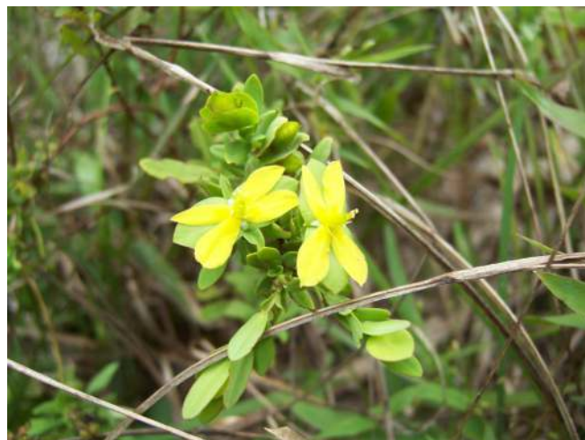
Photo: St. Andrews Cross ( Hypericum hypericoides)

St. Andrew's Cross grows in dry or moist, sandy or rocky soils from New Jersey to Oklahoma and south to Florida, Texas and Central America. The blooming period is early, from May through August. St. Peter's Wort grows in damp, sandy soil from Long Island to Oklahoma and eastern Texas, blooming later, from June through October.