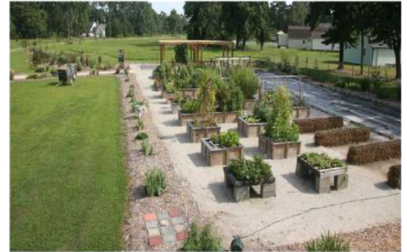
York/Poquoson Master Gardeners Learning Garden at Poquoson Museum

January 19 , Virginia Horticultural Foundation's program "Gardening Freedom! Home Gardener's Day" http://vcemastergardener.blogspot.com/2014/11/gardening-freedom-home-gardener.html December 22 for early registration $80 includes lunch