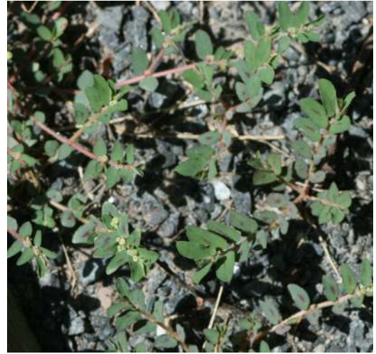
Photo: Spotted Spurge ( Euphorbia maculata ) taken by Helen Hamilton

toxic if ingested. The name maculata , “spotted,” refers to the purplish mark on the leaf.