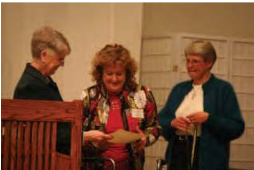
Scene from the Graduation Dinner January 15, 2009.

We will need to be creative in this process and do our ground work before the plant sale. We will have a planning meeting early in February. If you would like to volunteer for this task please let me know by e-mail ( arthurg@cox.net ) or just give me a call (564-1888).