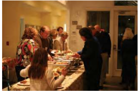
Scene from the Graduation Dinner January 15, 2009.