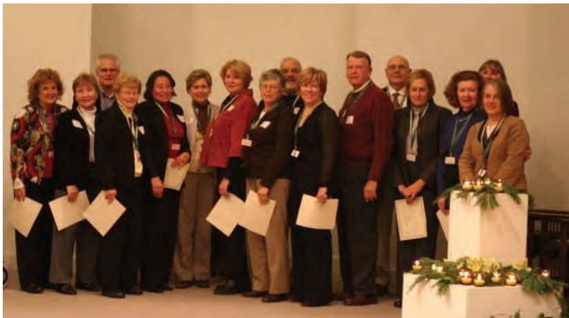
Class of 2008 - Graduation, January 15, 2008

Plan to join us on January 14, 2010 for next year's dinner.