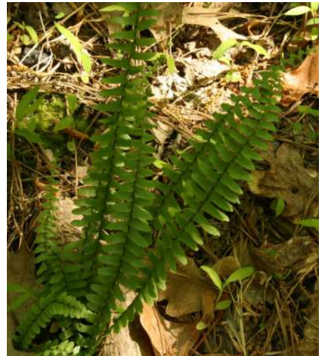
Photo: Ebony Spleenwort ( Asplenium platyneuron ) taken by Helen Hamilton

This little fern grows in moist but well-drained locations throughout eastern U.S. Very adaptable, it occurs in open woodland, on rocky banks, and on rotting logs, but thrives especially in thickets and other disturbed areas. Frequently colonizing masonry in urban and rural sites, it prefers calcareous rocks (or mortar joints) but will also grow on subacid rock. Ranging from Quebec to Kansas and Colorado and south to Florida, Texas and Arizona, Ebony Spleenwort is found in every county in Virginia. Spores are formed May through September.