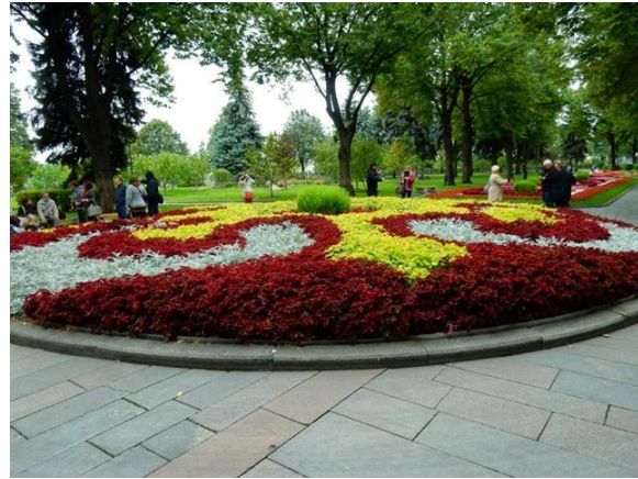
Park in St. Petersburg

Even though Russia is much farther North than SE Virginia, the summer blooming plants are surprisingly similar. (begonia, coleus, dusty miller, etc.) The "White Night", a period of almost total light, exists from mid May until early July. As a result of little darkness, flowering plants grow quickly and are very large!