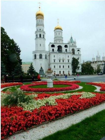
Garden at The Kremlin/Moscow

A series of photos from a trip Pat Crowe and her husband took from St. Petersburg to Moscow in September