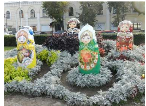
"We are the Girls from Sochi" - park in Yaroslavl.

← Mosses are doll figures made from moss, cones and other natural materials. They are from the early 20th century and are found in the Vyatka province in Western Russia. (Photo taken in Russian Museum, St. Petersburg, Russia )