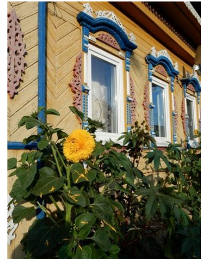
Sunflower in Mandrogi

← This small garden is located on Kizhi, one of 1650 islands in Lake Onega in the region of Karelia (one of the oldest inhabited sites in Russia.) and home of many wooden structures made without nails. At just 500 km (300 miles) south of the Arctic Circle, the summer highs are only in the 60s. (It was a brisk 40 on the day we visited in early September.) As you can see, greens and other root crops grow well.