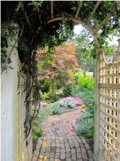
More photos from the Pinkham gardens