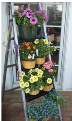
Table experts and Helpdesk were available to give customers advice. Wow! A plant sale is a lot of work! Having so many of you involved made it much easier for everyone. Many of you contributed wonderful plants, and some of you who were not able to physically lend a hand helped by sponsoring an area. I'd say we came very close to the 100% participation that the steering committee was seeking!