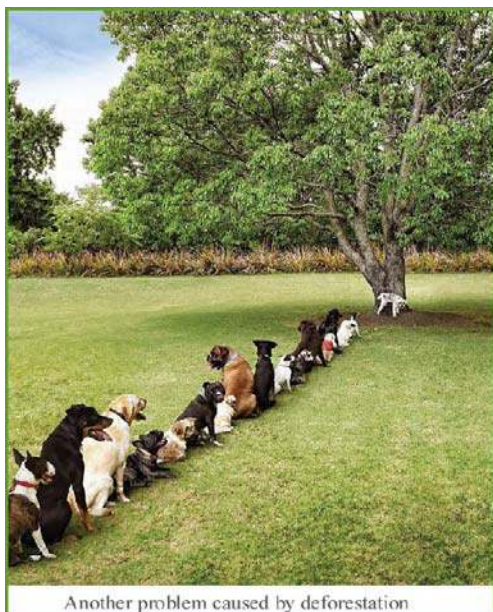
Another problem caused by deforestation