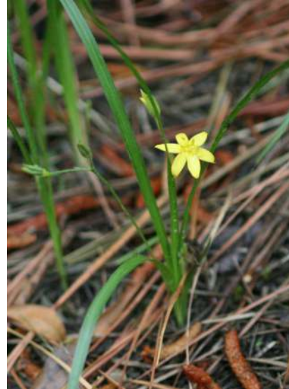
Photo: Yellow Stargrass ( Hypoxis hirsuta )

The genus name is from hypoxys , probably meaning “somewhat acid;” hirsuta is Latin for “hairy.” This small plant can be easily confused with a grass unless the flower is seen.