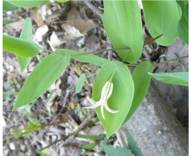
Photo: Perfoliate Bellwort ( Uvularia perfoliata ) taken by Kathi Mestayer in her backyard

Also called Merrybells, these perennials are most abundant in calcareous soils in moist to fairly dry hardwood forests. Both are widespread across Virginia. Perfoliate Bellwort ranges from New Hampshire to