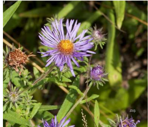
Photo: New York Aster ( Symphyotrichum novi-belgii )

New York Aster grows along shores, in damp thickets and meadows, occurring in every county in Virginia, but only in the coastal states of the U.S. and Canada. The range is from Newfoundland to South Carolina, found often in salt marshes. It blooms September-November.