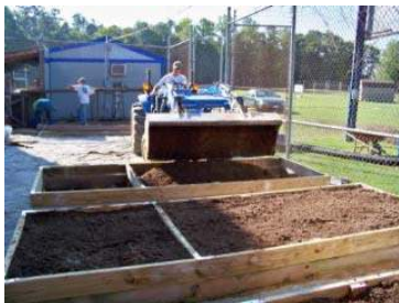
Beds before planting