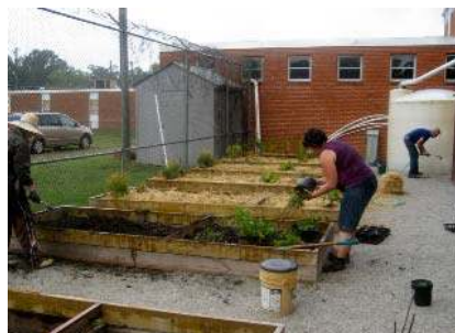
Nearly done with 9 beds!