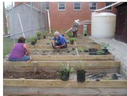
Planting fall veggies