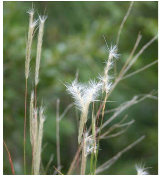
Photo: Splitbeard Bluestem ( Andropogon ternarius ) taken by Helen Hamilton

Seeds are eaten by wild turkey, juncos, chipping sparrows, and the foliage is often browsed by white-tailed deer.