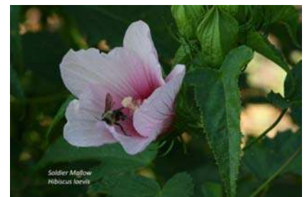
Solder Mallow Hibiscus laevis