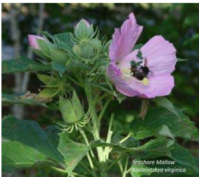
Seashore Mallow Rosteletzkya virginica