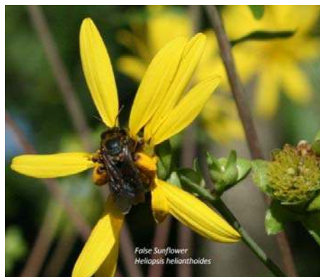
False Sunflower Heliopsis helianthoides