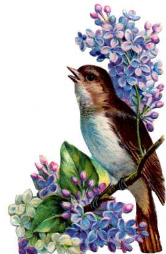
The Graphics Fairy

I have received the majority of replies but have a few outstanding ones. If you have sent your email to me, many thanks. If not, please note that the new deadline is May 1.