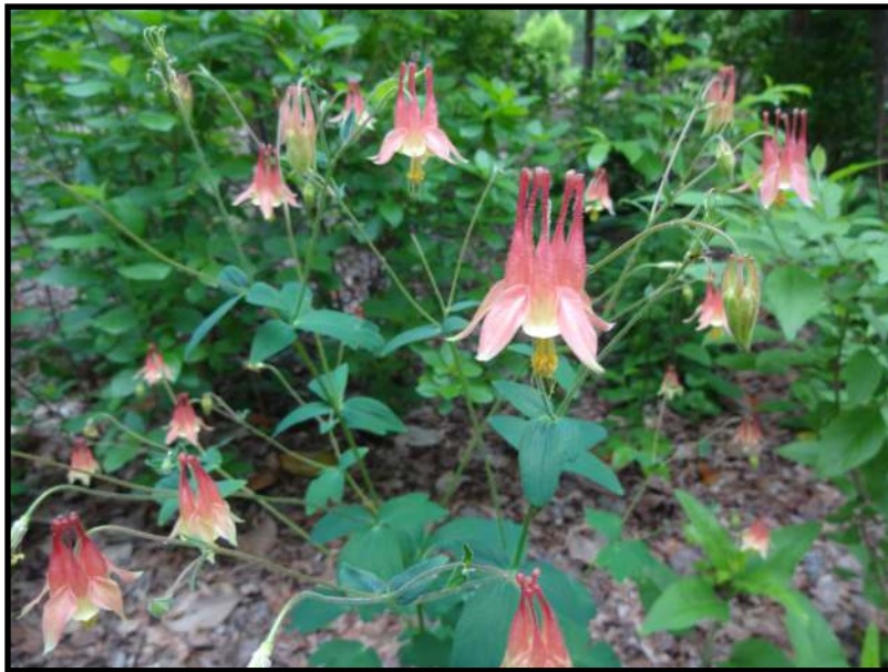
Photo: Red Columbine ( Aquilegia canadensis ) taken by Helen Hamilton

This is one of our loveliest early spring flowers, with hanging red flowers that have long spurs and yellow centers. The nectar at the base of the spurs attracts long-tongued insects and hummingbirds. The flowers are mature when migrating hummingbirds appear in our area, and are important food for these little birds, and for early butterflies and bees as well. Insects seeking the nectar will brush against the extended anthers, collecting pollen to transfer to a neighboring flower with receptive female parts.