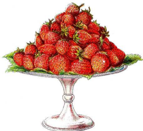
The Graphics Fairy