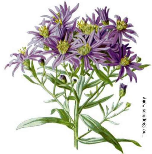
The Graphics Fairy

This sale will NOT be advertised to the general public. All notifications will go only to JCCWMGA MGs via the common Google email account. All funds generated from the sale will go directly into our treasury.