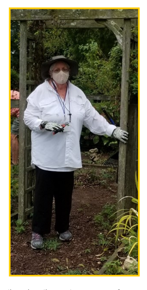
This article is continued on the next page, page 6