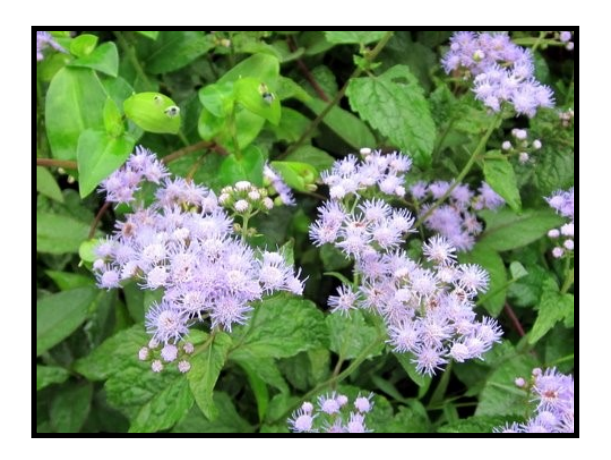
Photo: Blue Mistflower ( Conoclinium coelestinum ) taken by Helen Hamilton at the Williamsburg Botanical Garden. Below: Monarch butterfly on a mistflower.

Conoclinium coelestinum (formerly Eupatorium coelestinum)