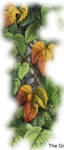
The Graphics Fairy