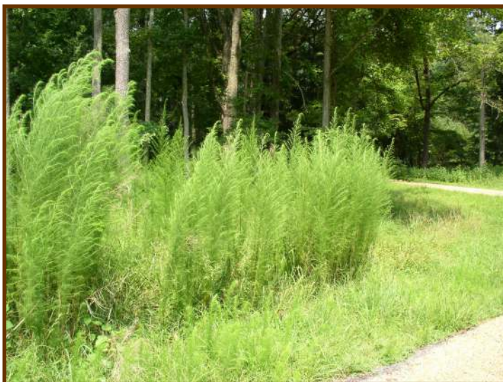
Photo: Dog-fennel ( Eupatorium capillifolium )

In late summer drifts of dog-fennel line roadsides and woodland edges with their lacy fernlike leaves, narrow and very finely divided. In early fall from September through November, the tiny daisy-like white flowers are replaced by small red berries. As the fruits age, the seeds develop hairs, like those of dandelions, allowing dispersal by the wind.