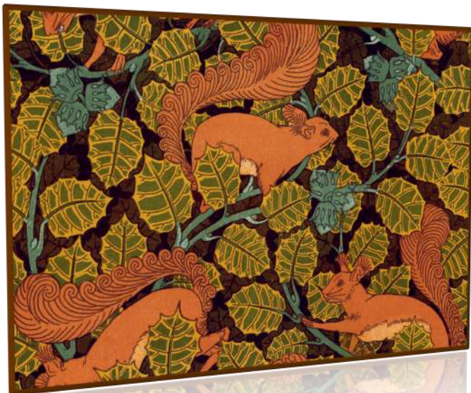
The Graphics Fairy