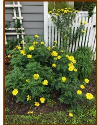
Photo of marigolds