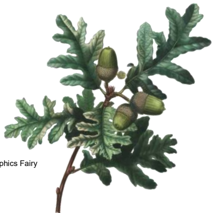
The Graphics Fairy