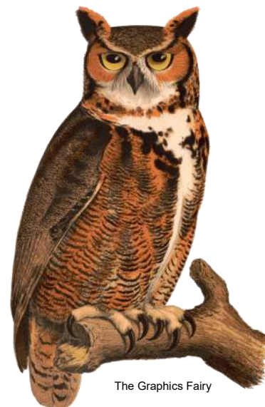
The Graphics Fairy

I'll go into a bit more detail at our monthly meeting November 5, but archiving the association's records through the WHRA is something the board is considering seriously. Stay tuned.