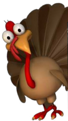
My quarantine buddies. Photograph by Dogsburg Grooming. Turkey: ClipArtBest.com