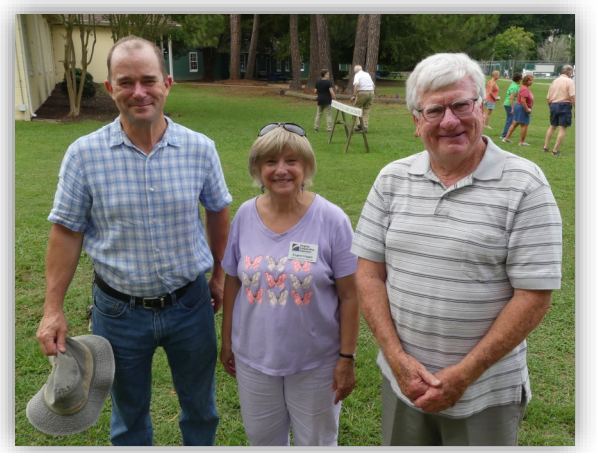
Thank you to our Picnic Leaders!

The Nominating Committee has been formed and is working on a slate of officers for 2023. We will be voting in September. Please seriously consider whether you are able to take on a leadership role. We will need to nominate a President-Elect and a VP of Internal Education.