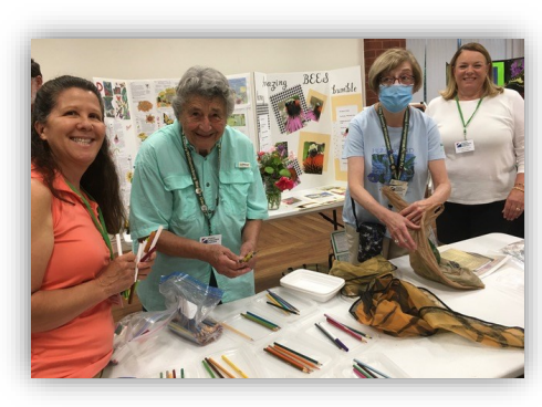
Several MGs prepare and dispense craft supplies for the craft portion of the program.