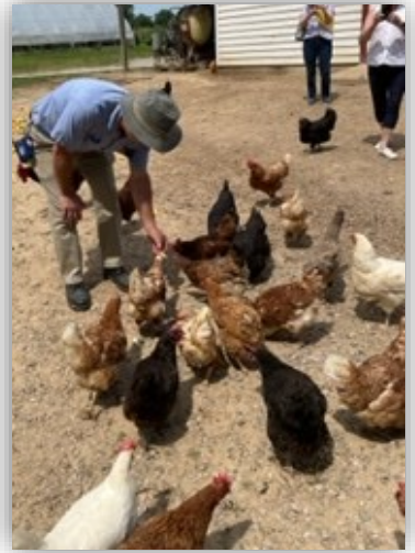
Chickens on Kelrae Farms