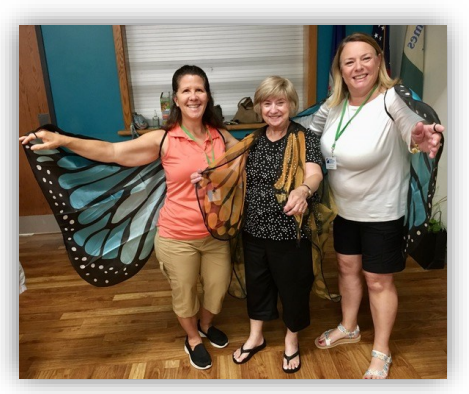
MGs spread their wings for the butterfly portion of the program.