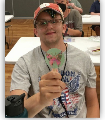
A participant from the Arc of Abilities shows off his butterfly magnet.