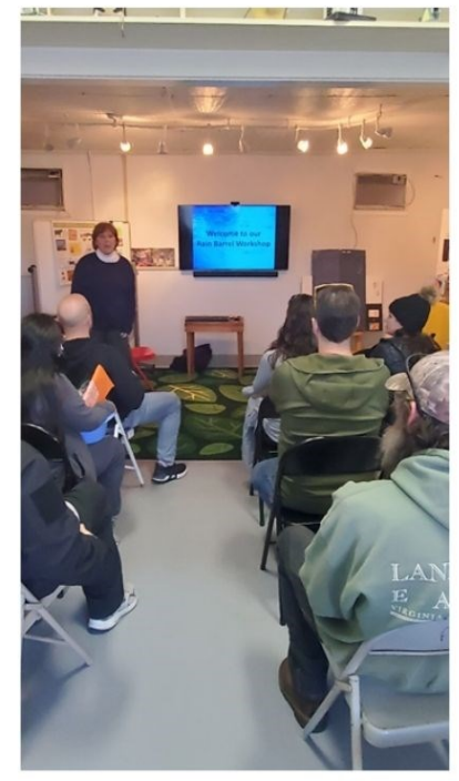
Rain Barrel Workshops