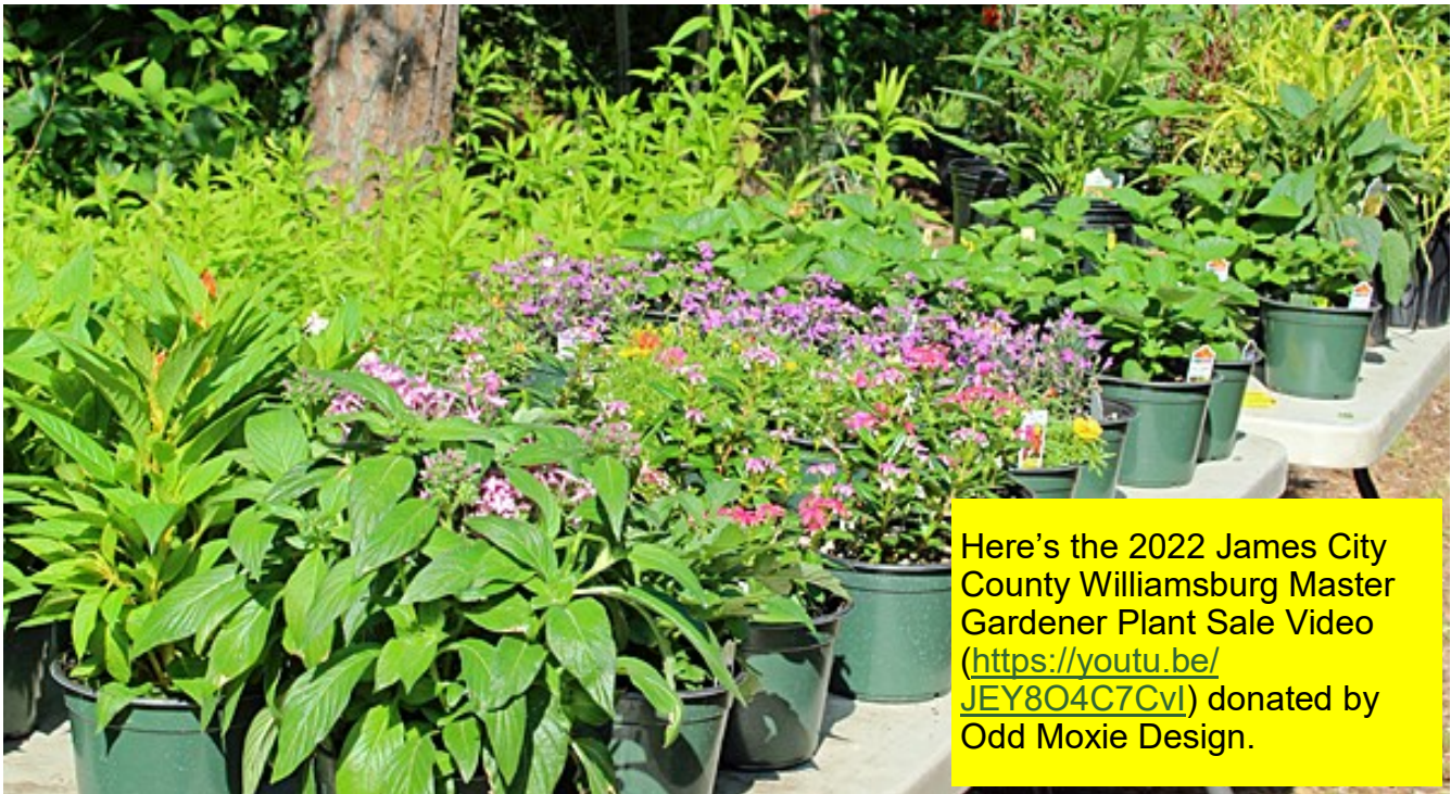
Here's the 2022 James City County Williamsburg Master Gardener Plant Sale Video ( https://youtu.be/JEY8O4C7Cvi ) donated by Odd Moxie Design.

Notify me with the number and size of the pots you require and we will have them ready for you. We are suggesting a minimum of 10 plants for each EMG. Email me at gstreb11@gmail.com or text at 757-871-7369. Days/times will be announced later---watch for the Instructional Email. Then just fill your clean pots with your plants and deliver your healthy specimens to the Williamsburg Botanical Garden on May 5. Any questions or problems? Contact me and I will get with the appropriate committee leader to quickly provide a solution.