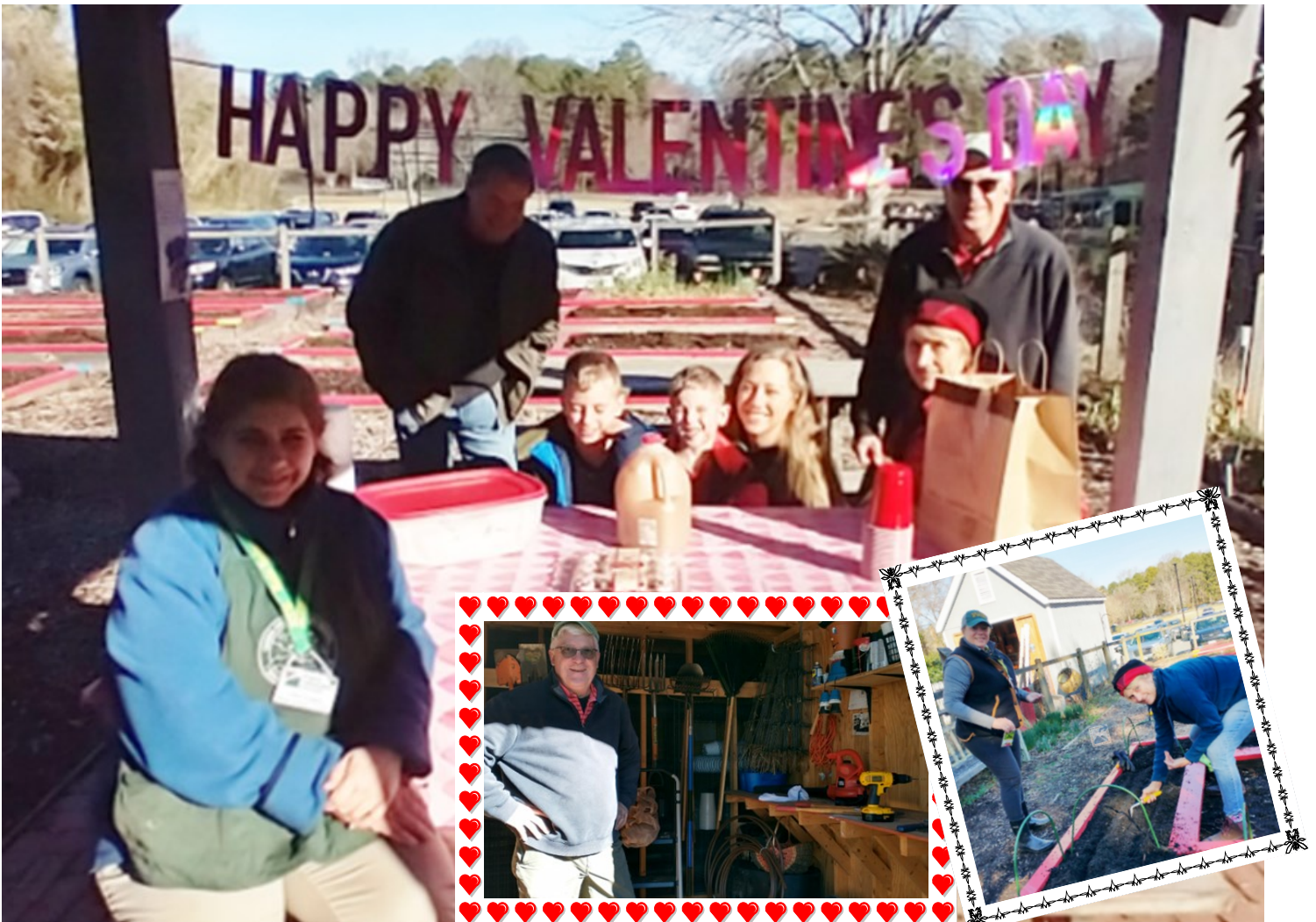
Along with cleaning up the garden shed and planting lettuce, the elementary school students at Mattey's Garden enjoyed some treats on Valentine's Day.