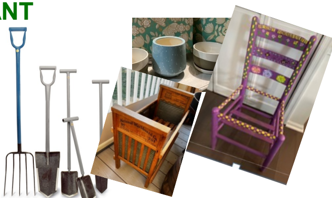
Page 6